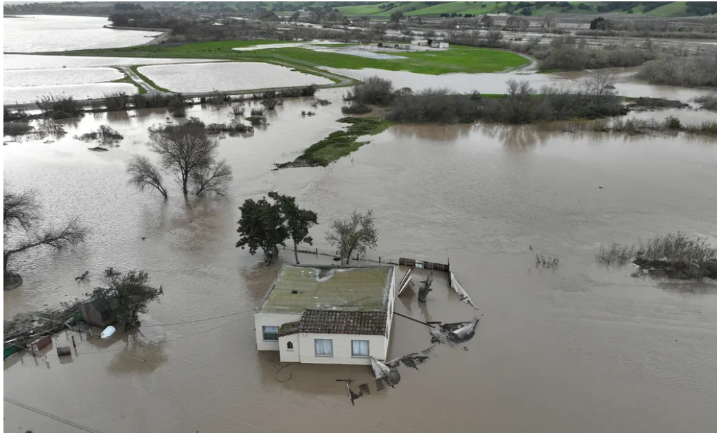
A home submerged in floodwater as the Salinas River begins to overflow its banks in Salinas, California.

Severe storms brought on by this weather phenomenon have dumped 30tn gallons of water across the state