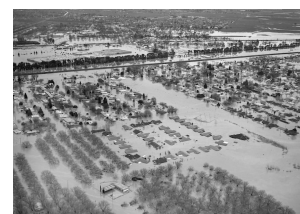
A massive 1986 Northern California flood near Marysville, north of Sacramento, caused the south levee of the Yuba River to breach, forcing thousands of residents to evacuate their homes.

Meanwhile, the method known as Forecast-Informed Reservoir Operations (FIRO) aims to use the latest forecast technology to plan for the arrival of atmospheric rivers. California reservoirs such as Lake Mendocino in Mendocino County, Folsom Lake northeast of Sacramento and New Bullards Bar Reservoir northeast of Yuba City are using the method to retain as much water as possible during the short storm window.