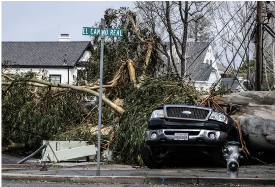
📷 A tree, blown over by 50 mph winds, crushes a parked car in El Camino Real in Burlingame, California.

It's all in the name here - ARs are exactly what they sound like. These long streams of overhead moisture - or as the National Oceanic and Atmospheric Administration (Noaa) simply says, the “ rivers in the sky ” - have delivered both destructive and drought-reducing downpours across the state with alarming intensity.