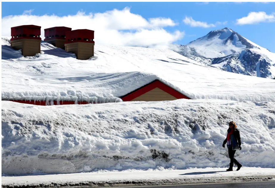
📷 A person walks past a snowbank in front of a restaurant in Mammoth Lakes, California.

Along with amplifying risks from rain-related floods, warmer downpours on the snowpack also spark rapid runoff concerns. It also could eat into what California considers a water savings account of sorts, by rapidly melting the snow that sits high atop mountain ranges and typically trickles more slowly through systems during spring and summer.